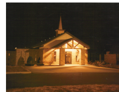
ST. TIMOTHY'S LUTHERAN CHURCH